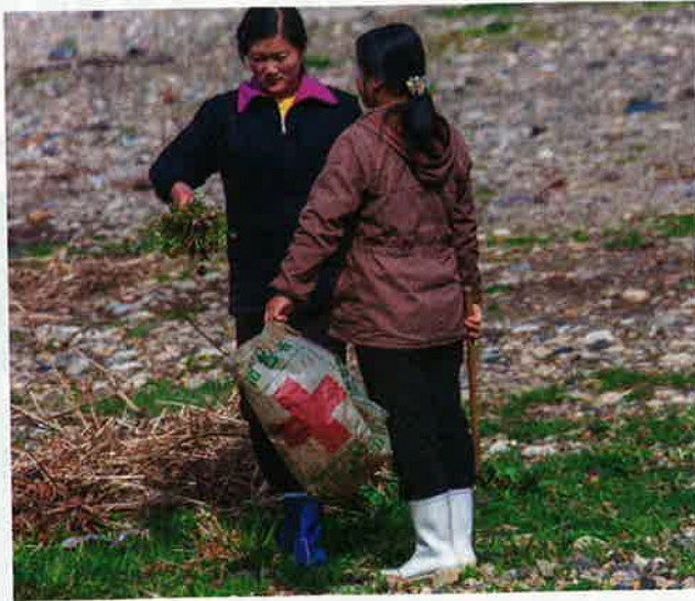
Grass for lunch: Amid widespread famine, North Korean girls collect grass to eat in the village of Jung Pyong Ri in 2010.

"The benefits of being a nuclear power—to deter external threats and prove strength domestically—must in his mind outweigh the costs of facing yet another round of condemnation and sanc-