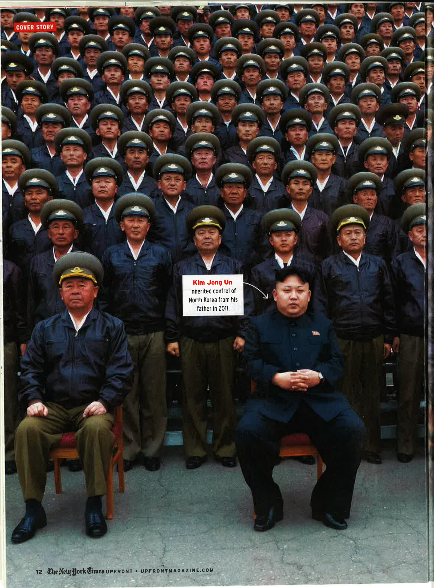
Kim Jong Un inherited control of North Korea from his father in 2011.